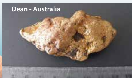
Dean - Australia