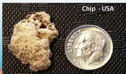
Chip - USA